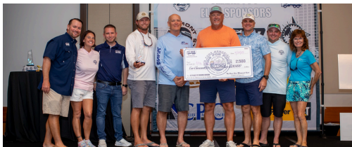
First Place Adult Division Inshore Team: Team Alta Equipment with a 90' Total Length