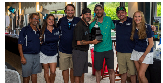
Board members with the 2025 golf tournament winning team

On July 26, 2025, we hosted a sold-out tournament at the picturesque Mystic Creek Golf Course & Banquet Center in Milford, MI. Now in our fifth year at this great venue, the staff once again provided exceptional service. We switched things up this year, playing on the Meadows and Lakes courses. Sunny skies and pristine course conditions made for an outstanding day on the greens. Feedback on the course change was overwhelmingly positive, contributing to a positive and fun atmosphere for everyone involved. Our board members went above and beyond to enhance the experience, offering a variety of games and contests for golfers. The day was topped off with delicious food and beverages at the dinner banquet, and a lively raffle featuring amazing prizes from our generous sponsors.