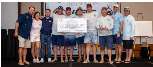
First Place Adult Division Offshore Team: Team United Rentals with a 60.4 lb Total Weight